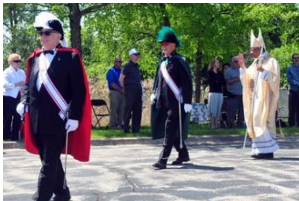
The procession out after Mass