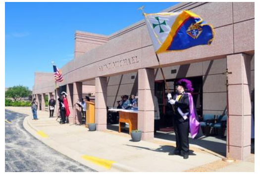
Color Guard in front of the Altar