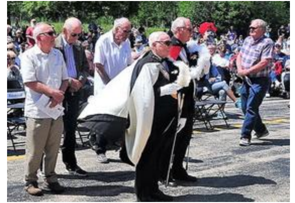
Veterans, came forward