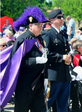
Bringing the gifts up