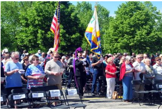
Color Guard leading us in