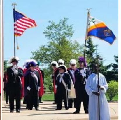
Procession in before mass