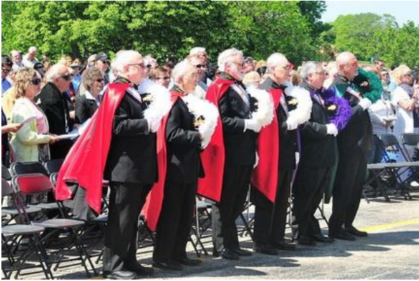
One side of the group pf Knights