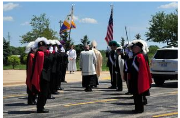
Beautiful & respectful ending