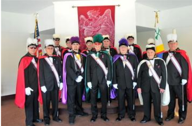
Sir Knights there that day